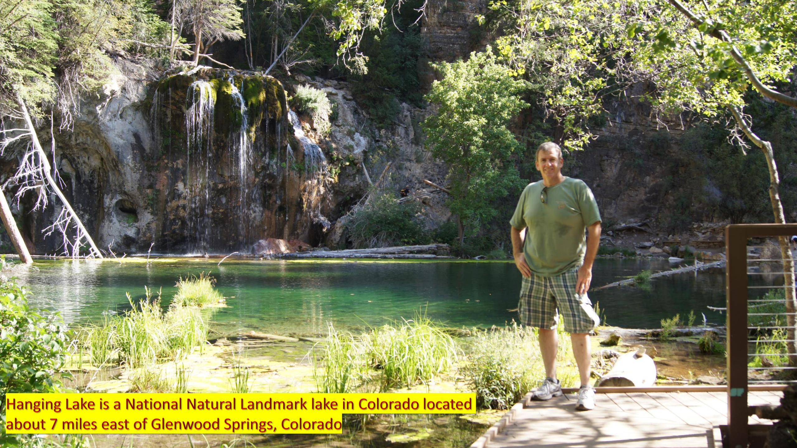
Hanging Lake is a National Natural Landmark lake in Colorado located about 7 miles east of Glenwood Springs, Colorado