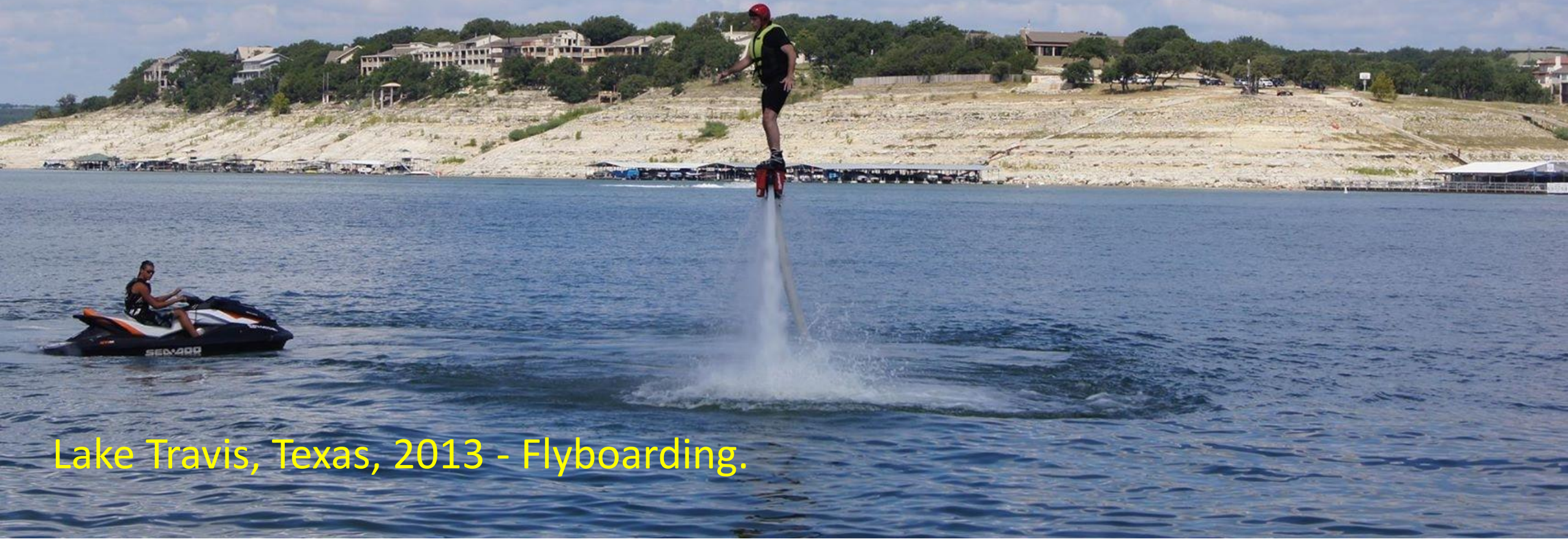
Lake Travis, Texas, 2013 - Flyboarding.

As you all “propel” out of here, 😊 Thank you for listening and being a part of TMHRA. And I thank TMHRA for allowing me to speak on this matter, as it is truly a life-or-death situation.